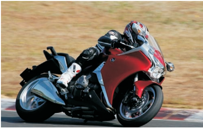
2010 Honda VFR 1200F

The latest addition to the Honda range sets a new bench mark in sports touring and some lucky Snowy Ride entrant will own one at the end of the ride.